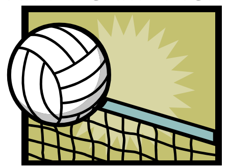
Tonight, June 29, 2019